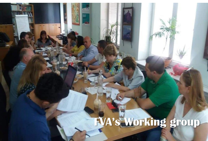
FVA's Working group

In March 2019, we joined the Working Group established for drafting of the new surplus food donation law. The group gathered representatives of 9 plus institutions such as Ministry of labor and social policy, Ministry of agriculture, forestry and water economy, Ministry of finance &c., including relevant CSOs working in the field of surplus food redistribution, the Red Cross, the National Democratic Institute and the Association of the Units of Local Self-Government (ZELS).